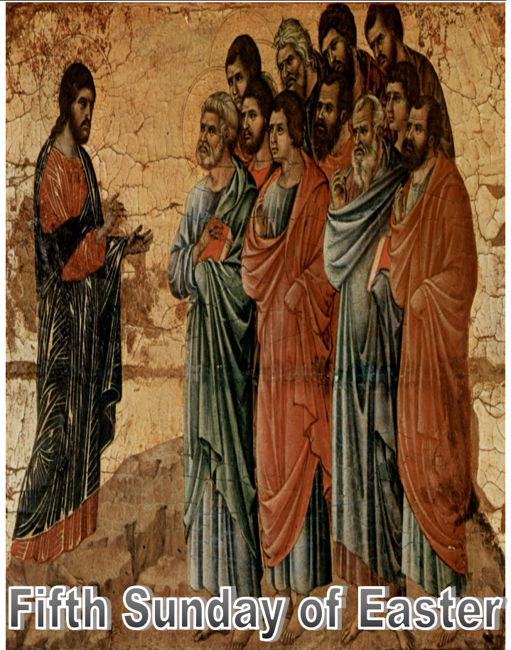
Fifth Sunday of Easter

WEEKDAY MASS Tuesday 6:30 p.m. Bilingual Wednesday - Friday 8:00 a.m. English