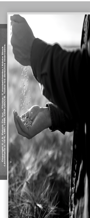
Copyright © J.S. Paluch Co. Inc. Licenciado © 1976, 1987, 1998. CEM-USCCB. Todos los derechos reservados.

DECIMOCUARTO DOMINGO DEL TIEMPO ORDINARIO