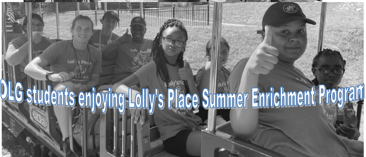
OLG students enjoying Lolly's Place Summer Enrichment Program