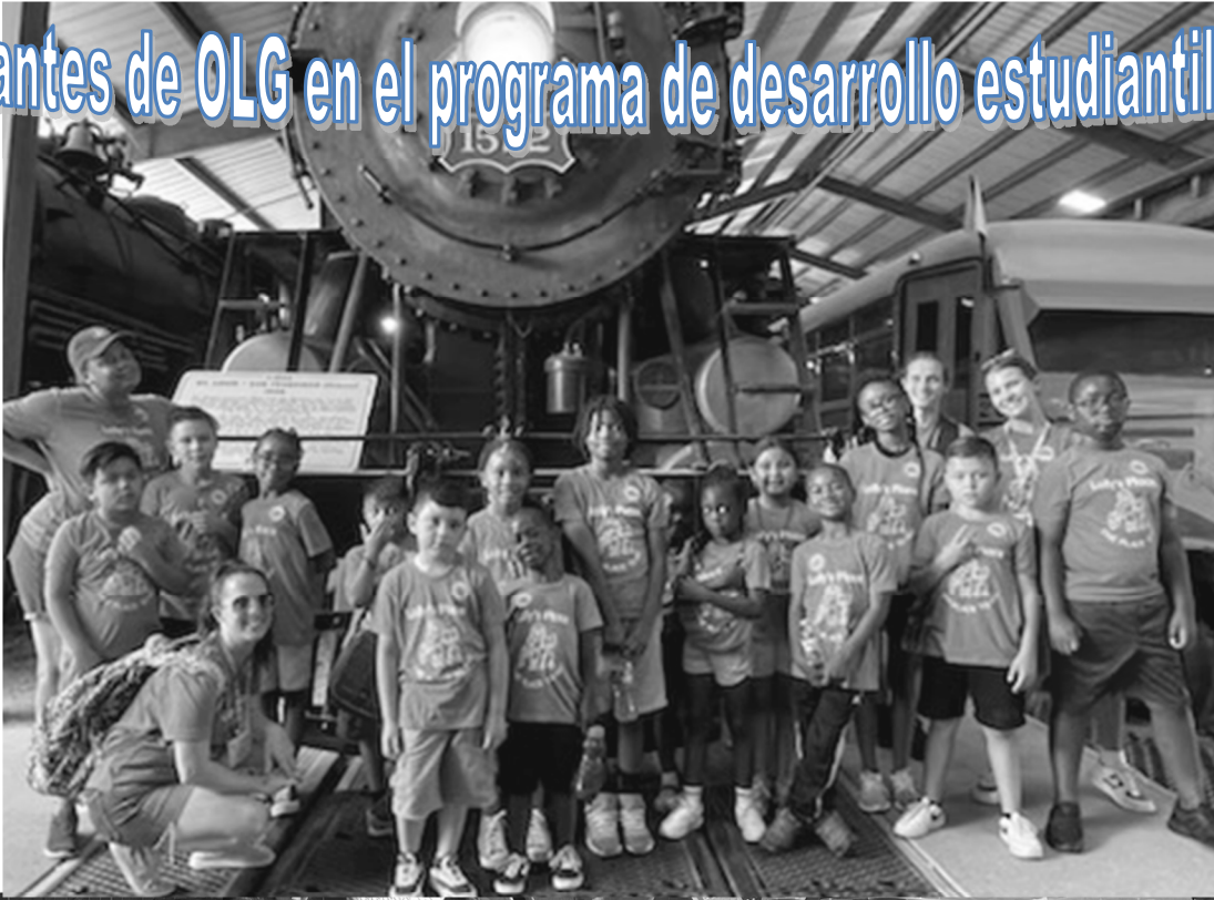
Estudiantes de OLG en el programa de desarrollo estudiantil de verano