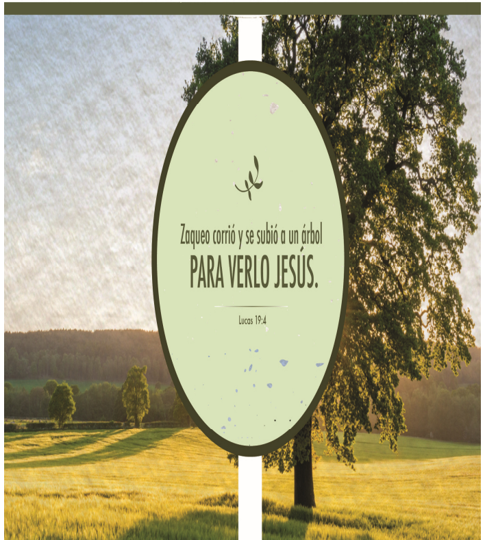
Copyright © J. S. Paluch Co., Inc. Lectionario © 1976, 1987, 1998, CEM-USCCB. Todos los derechos reservados.

30 OCTUBRE DE 2022 | TRIGÉSIMO PRIMER DOMINGO DEL TIEMPO ORDINARIO